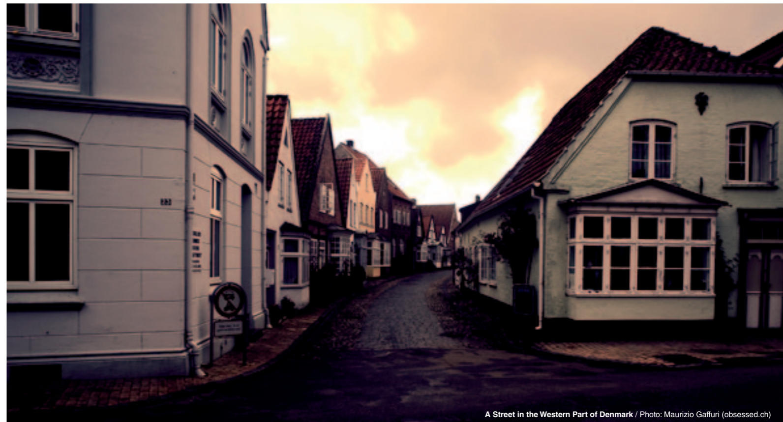
A Street in the Western Part of Denmark